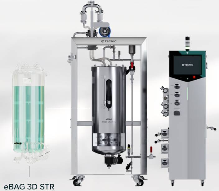
eBAG 3D STR

High-performance automatic bioreactor with cellular and microbial configurations, an excellent choice for pilot scale development and production.